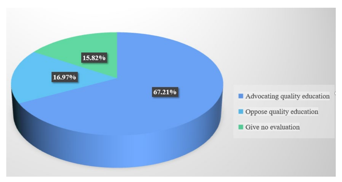
Figure 1 Proportion of the number of people who admire quality education